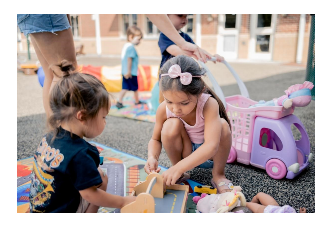
Playing with cars outside at Somersworth Family Morning Out

2nd Tuesday meets at Idlehurst Elementary in Somersworth, 4th Tuesday is online. <u>Sign Up Here</u>