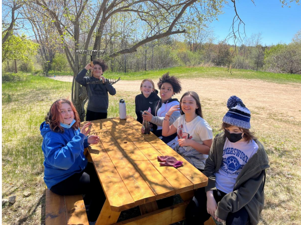
SMS Hug a Tree Sustainability Club getting ready to plant at the Somersworth Community Gardens.