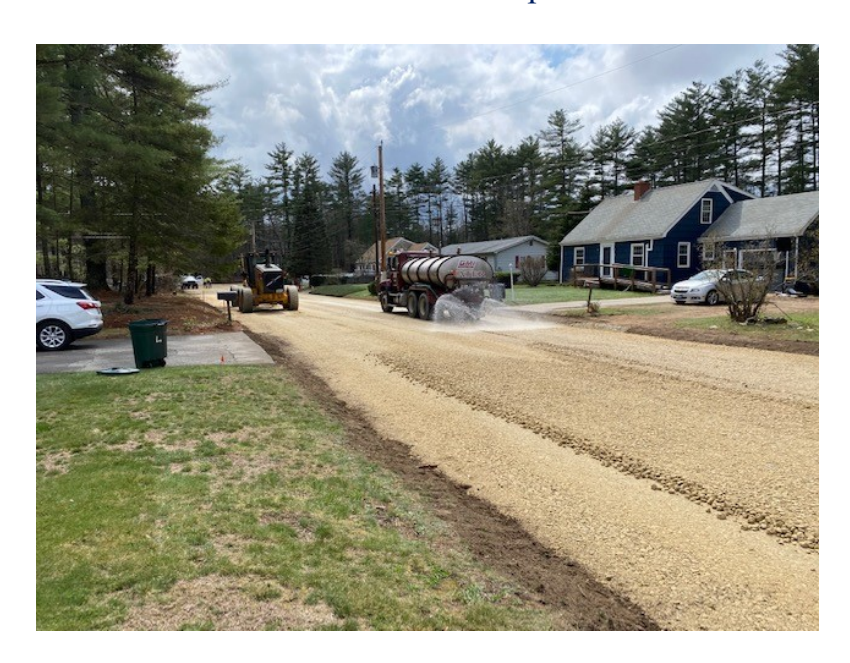
Paving on Maloney Street