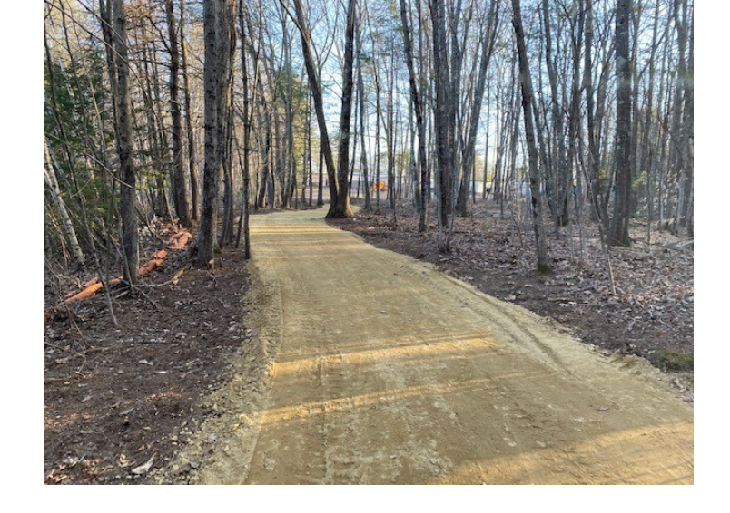
Campus Connector pathway ready for future Pavement