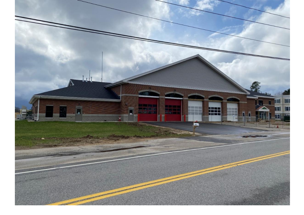
The new Fire Station as pictured on April 25. Progress continues on Phase II with exterior finishing as well as mechanical, electrical and plumbing systems.