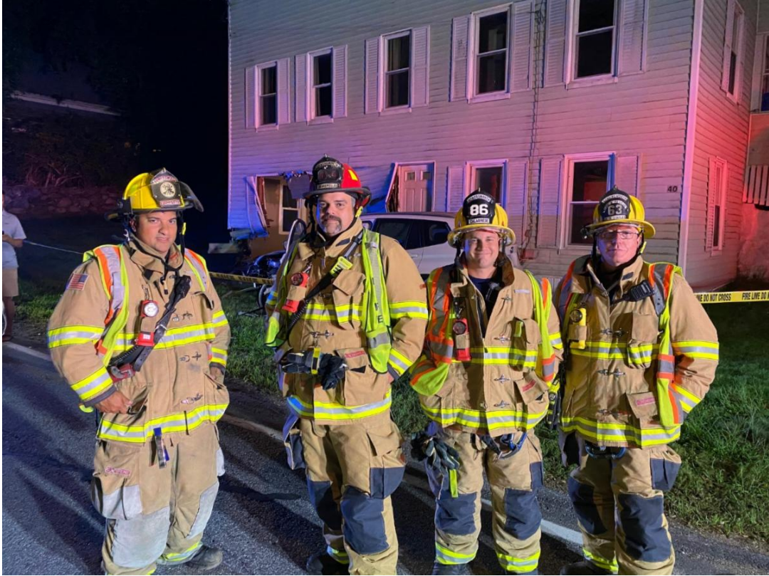
September 3 rd . Somersworth Firefighters operate at a car into a building incident on Winter Street at the corner of Page Street at approximately 8:15 PM on a warm evening. The Somersworth Police department and Stewart's Ambulance also responded. Fortunately, there were no serious injuries.