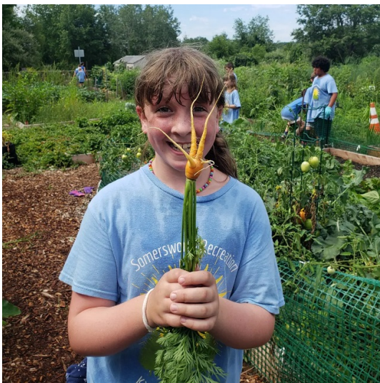
Recreation Program Summer Camper enjoying the Harvest at Malley Farm Community Garden School Plots