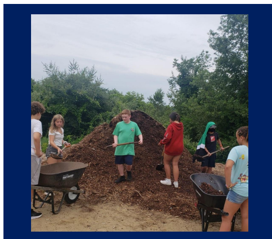
K-5 Rec Program summer camp field trip to Malley Farm and SYC Grades 6-8 summer program, Working hard and having fun